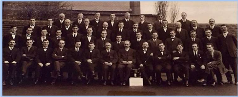
The Choir in 1916