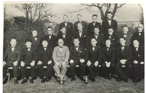
The Choir in 1953

You can learn about the next chapter in the Choir's history by checking out the information sheet, 'ADMVC 12 – The History of ADMVC from 1967 to 2016.'