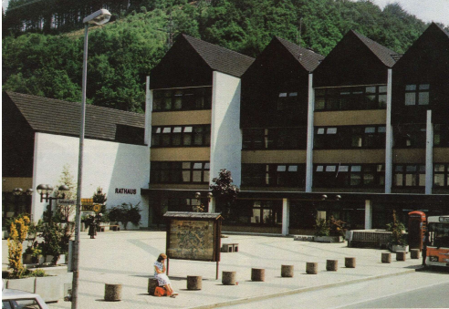
The Rathaus in Schalksmuhle