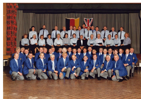
Ashington and Dahlebruck Choirs in 1985

'We sing a Requiem for Coal and Collier Men'