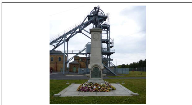
The Colliers' Memorial at Woodhorn Museum