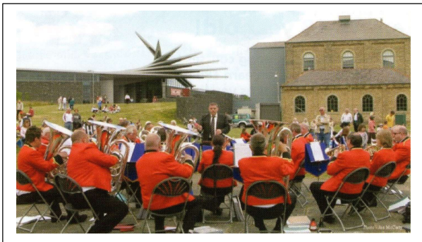
Massed Brass Bands at Woodhorn Museum